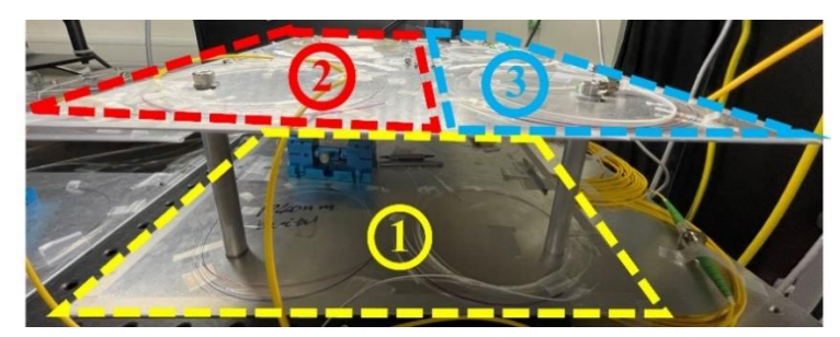
Fig. S1 Layout of the all-fiber laser system.

The below photo is the 1.8-µm all-fiber laser, including the cavity (Part 1) and the 1st amplifier (Part 2). Part 3 is the 2nd amplifier, which has not been used for this experiment. It can be used to further boost the laser average power.